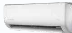
Serene wall hung split